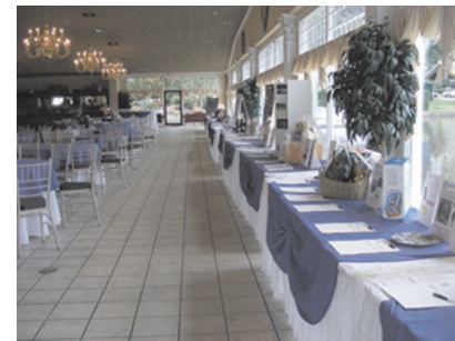
3M Auction drew 300 to an evening of good food, great bidding items and a chance to support the mission of the Club. The auction generated $25,000 and the golf tournament $23,000 for Club programs to serve the over 2,400 boys and girls ages 6-18 who are members of the Club.

The Meriden Hyundai Golf Tournament and the 3M Dinner/Auction drew large numbers once again this year. Despite postponement on the original date because of course flooding, 123 brave golfers teed off at Hunters' Golf Course on September 23rd to support the mission of the Club. On September 8th, the 3M Dinner/Auction went off without a hitch, much to the pleasure of the 225 attendees.