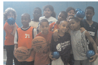
Summer Safe Havens boys and girls take a break from the Stamina Tests.

The Summer Safe Havens Drop-in Camp served over 250 youth with a variety of daily activities, lunch, trips to State sites and a summer session ending party. Funded by a grant from the Naugatuck Savings Bank and a Community Development Block Grant from the City, the 8 week program kept boys and girls safe and active.