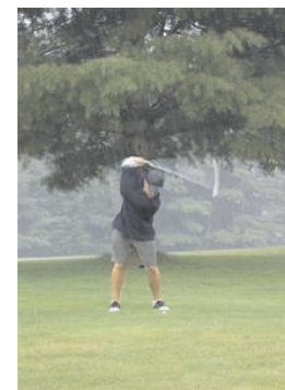
Driving rain didn't deter the 123 golfers who teed off on September 23, 2011 in the Meriden Hyundai/Boys & Girls Club Alumni Tournament.