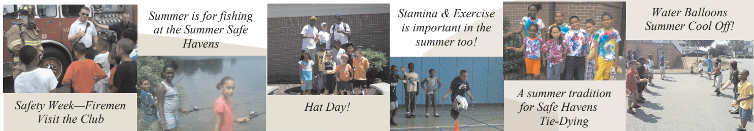
Safety Week—Firemen Visit the Club | Summer is for fishing at the Summer Safe Havens | Hat Day! | Stamina & Exercise is important in the summer too! | Water Balloons Summer Cool Off! | A summer tradition for Safe Havens—Tie-Dyeing

The program served over 250 youth primarily from the inner-city with great opportunities for fun and growth.