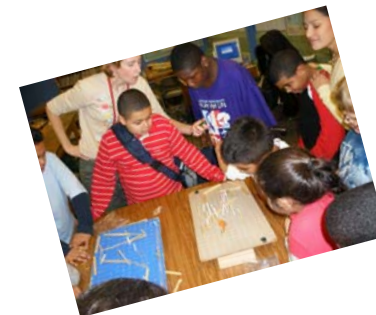
21st Century Community Learning Center Literacy participants work on Science activity presented at the Club by the Children's Museum of West Hartford. The activity is one of a series of 10 activities brought to the Club by the Science Center during the year.